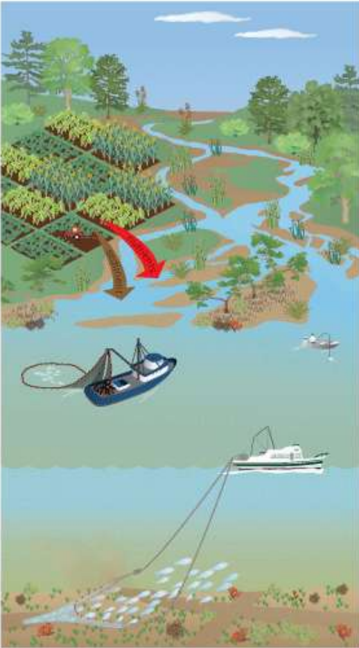
Overfishing + Agriculture